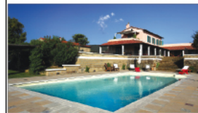
listings in Tuscany