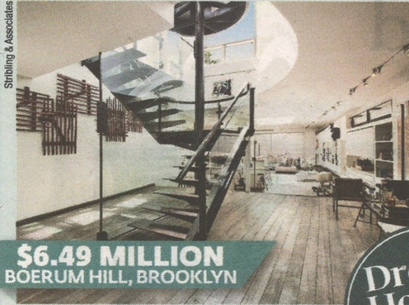
$6.49 MILLION BOERUM HILL, BROOKLYN

New York Post, Thursday, December 10, 2015 nypost.com