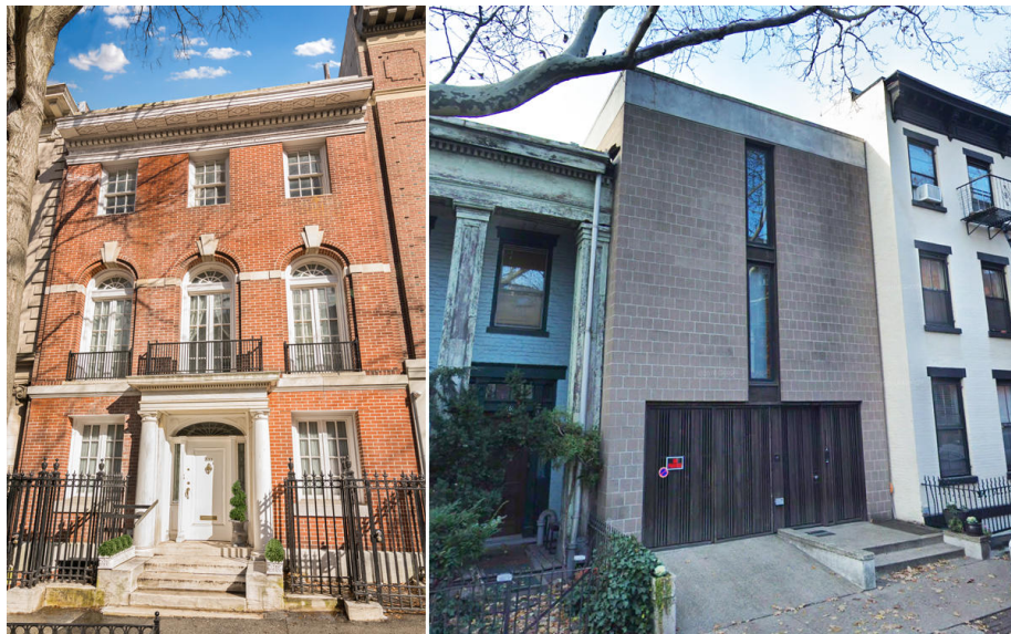
633 2nd Street and 44 Willow Place in Brooklyn

There were 13 contracts signed in Brooklyn's luxury market last week for a total of about $36.9 million.