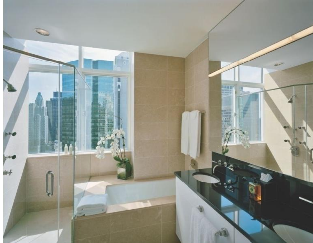
Even the bathroom has a great view.